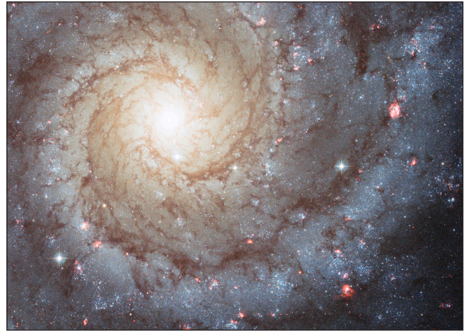
Webb will study star formation, like that taking place in galaxy M74.

The giant telescope will be fully assembled and optically tested on Earth before it is launched into the